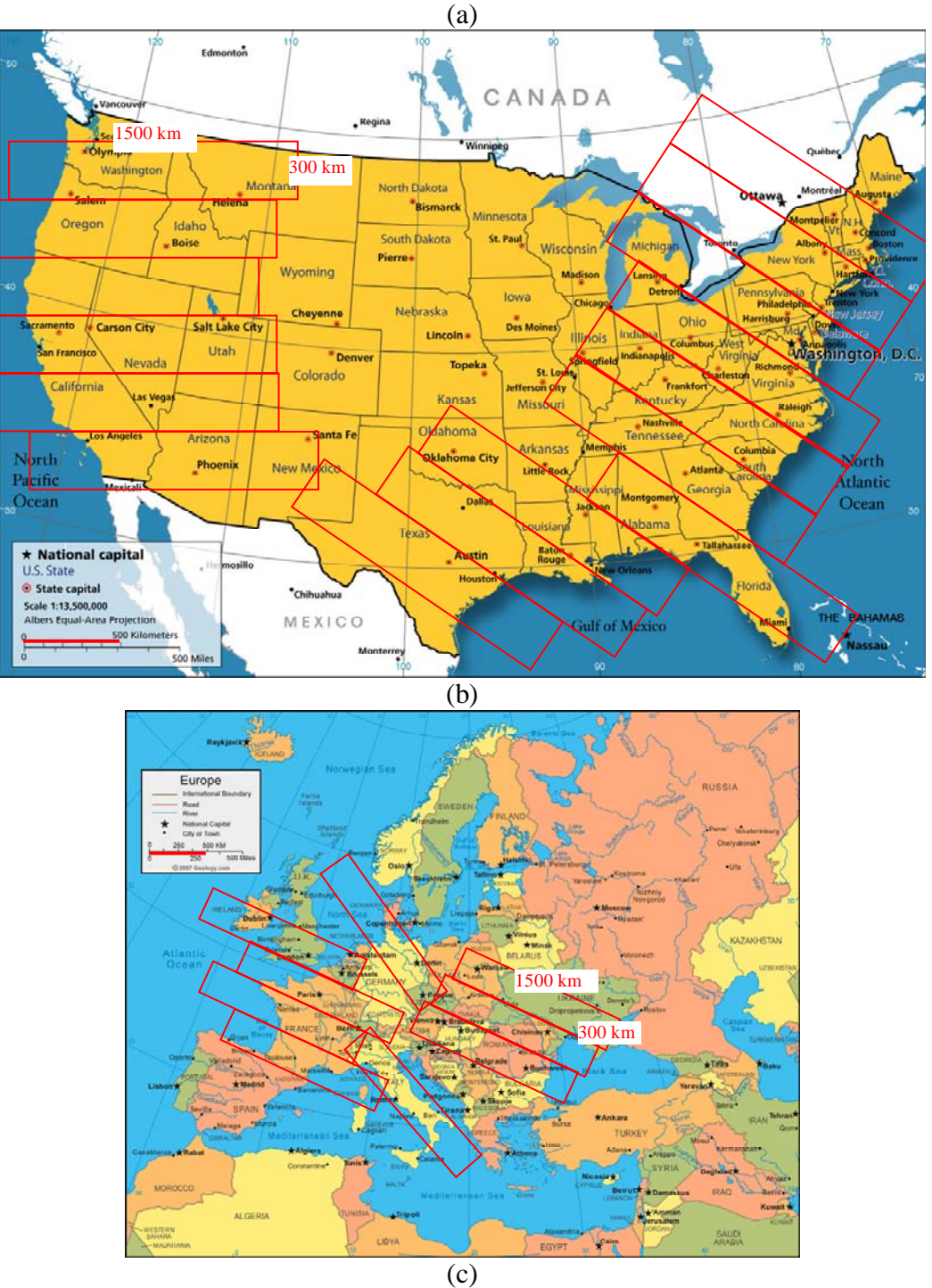
Fig. 2 - (a) The system for heating the ionosphere (Starting from the sea). (b) Possible region to be depressurized in an attack to USA. (c) Possible region to be depressurized in an attack to Europe.