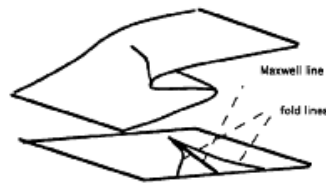
Figure 2.1: Cusp catastrophe